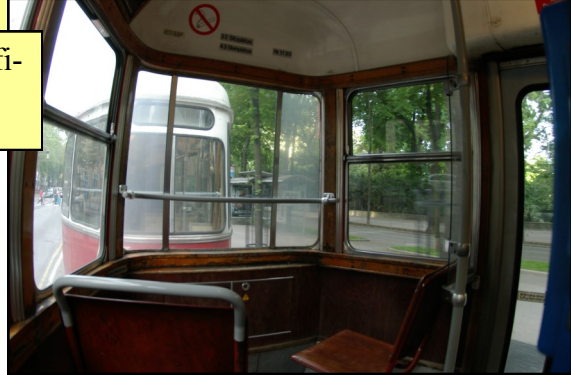
Circumnavigating the trams, railways, and busses is difficult but the only way to get around the city.