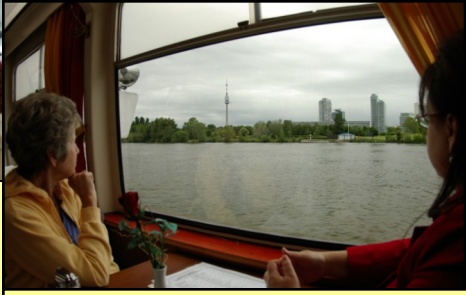
Taking a cruise on the Donau (Danube), which isn't blue.