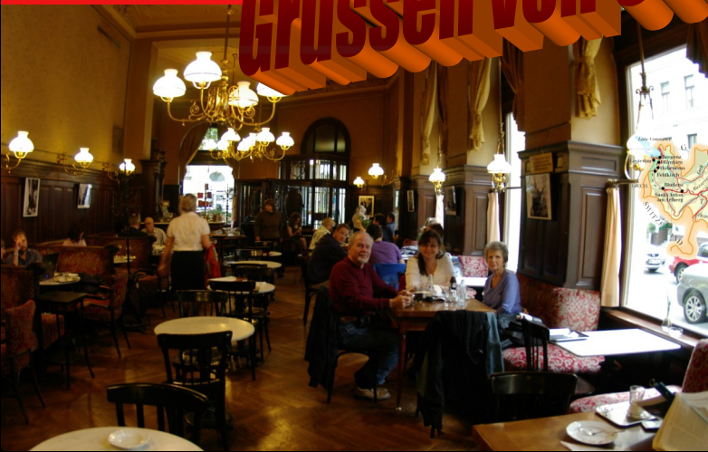
Café Sperl, dawnning the same décor as it's opening in 1880, has been home to much political upheaval as it was the planning place of those responsible for Vienna's secession. We, however, only enjoyed it's food and coffee; the coffee is rated the best in the world by several publications. We tended to agree.