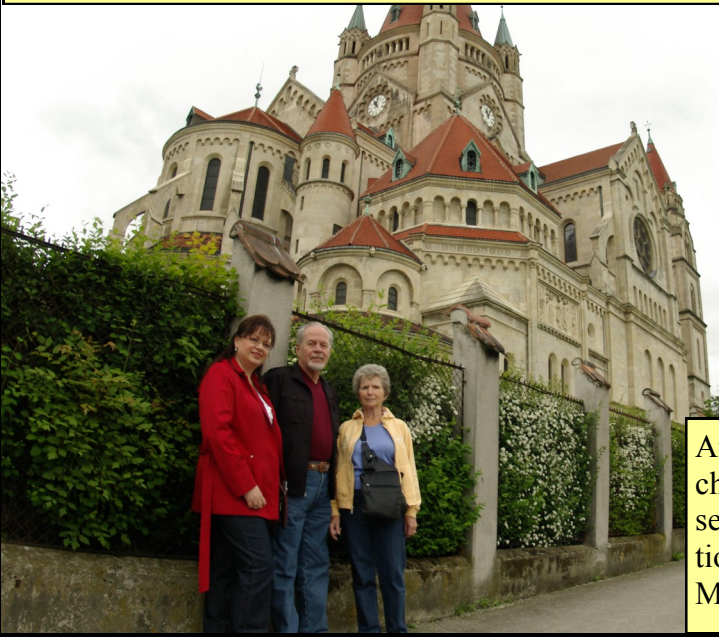
An undisclosed church used by several congregations on the Mexiko Platz.