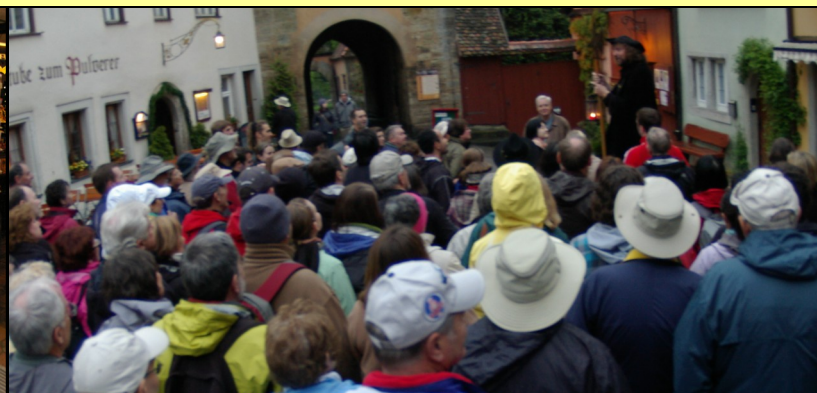
The Nightwatchman's tour is very popular and funny.