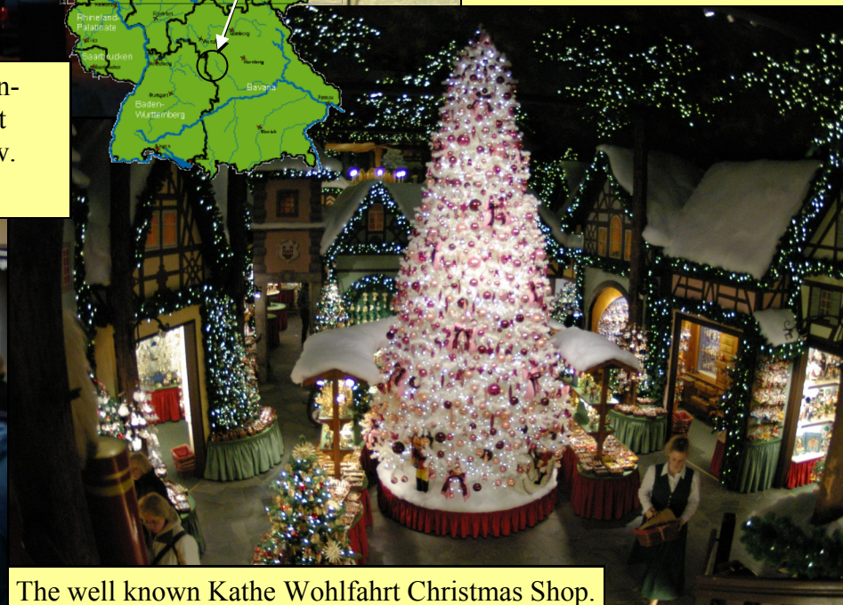
The well known Kathe Wohlfahrt Christmas Shop.